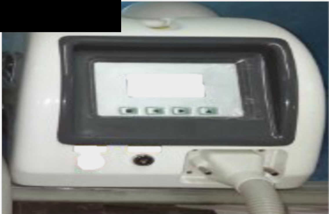
Nd:YAG Laser Appartus

A previous studies by [20] focused on the thermal effect of Nd:YAG laser on the bacteria because danger to human and cause many disease, the bactericidal influence of an altitude-power Nd:YAG laser on a commentary of Escherichia coli was shown that a cordiality rise up to 50° C next the utilize of laser together a power make of 100 W until 23 second.